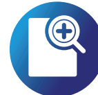
Data Collection & Evaluation